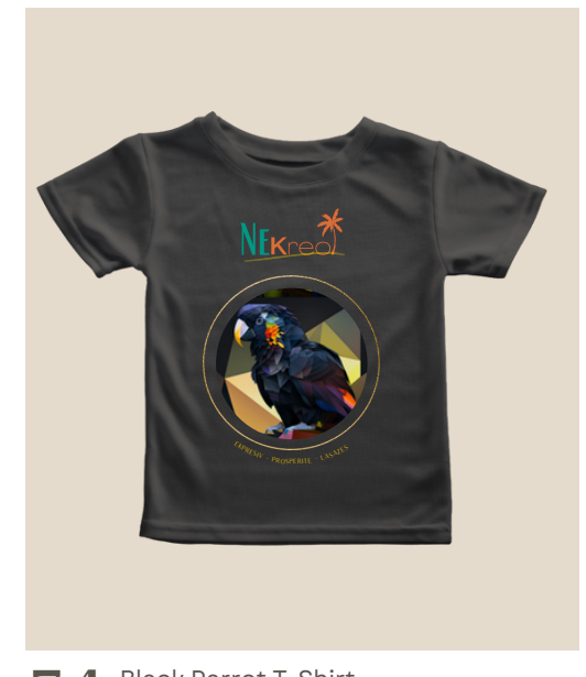
34 Black Parrot T-Shirt 3 Years | Unisex | SCR285