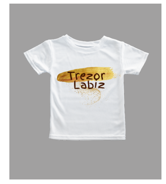
08 'Trezor Labiz' T Shirt 3-6 Months | Boy | SCR275