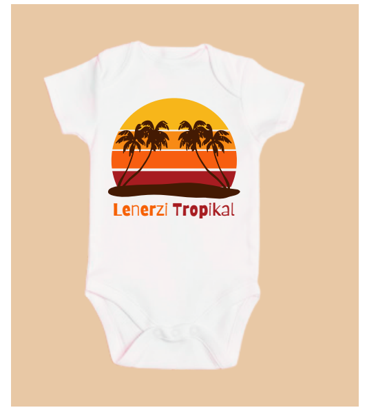
15 'Lenerzi Tropikal' Onesie | Unisex | 6-9 Months | SCR 285