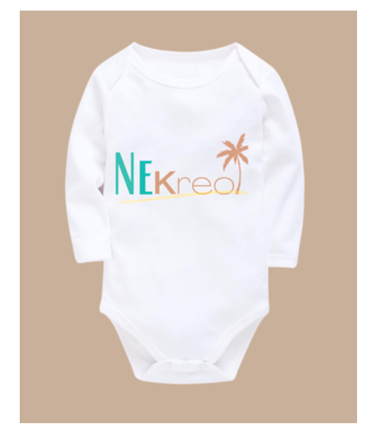
Nekreol Long Sleeve Onesie 0-3 Months | Unisex| SCR275