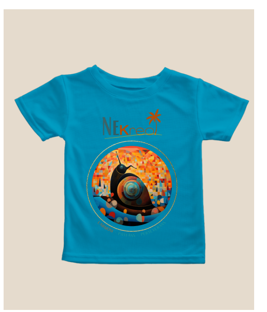
32 Stylodonta Snail T-Shirt 12-18 Months | Unisex | SCR285