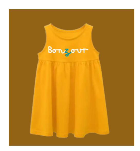
28 Bonzour Dress 1 Year | Girl | SCR 290