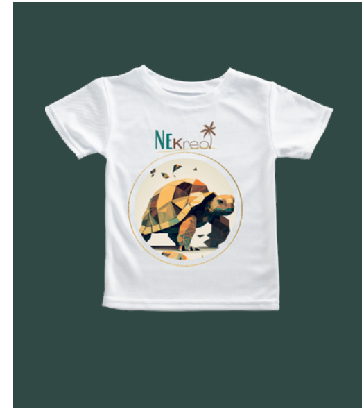
Giant Tortoise T Shirt (White) 12-18 Months | Unisex | SCR 285