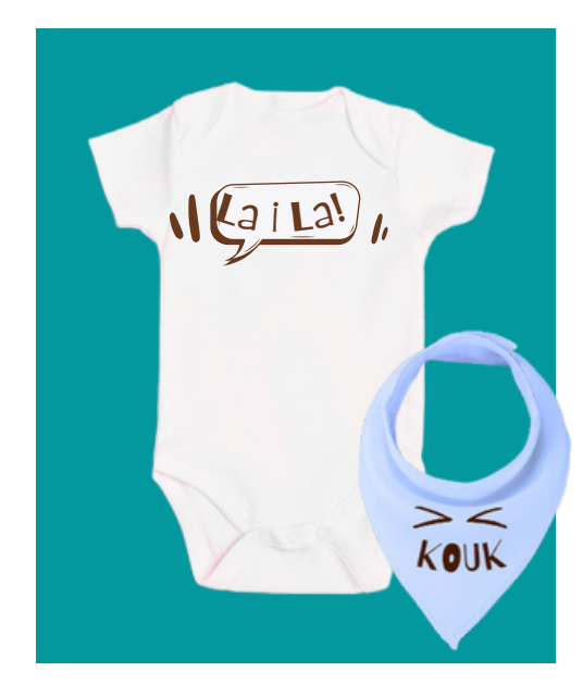
17 "Kouk, La I La" Onesie + Bib (Blue) | Boy | 6-9 Months | SCR 325