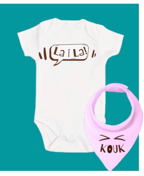
18 "Kouk, La I La" Onesie + Bib (Pink) | Girl | 6-9 Months | SCR 325