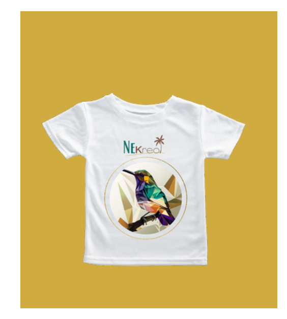
22 Sunbird T-Shirt (White) 12-18 Months | SCR 285