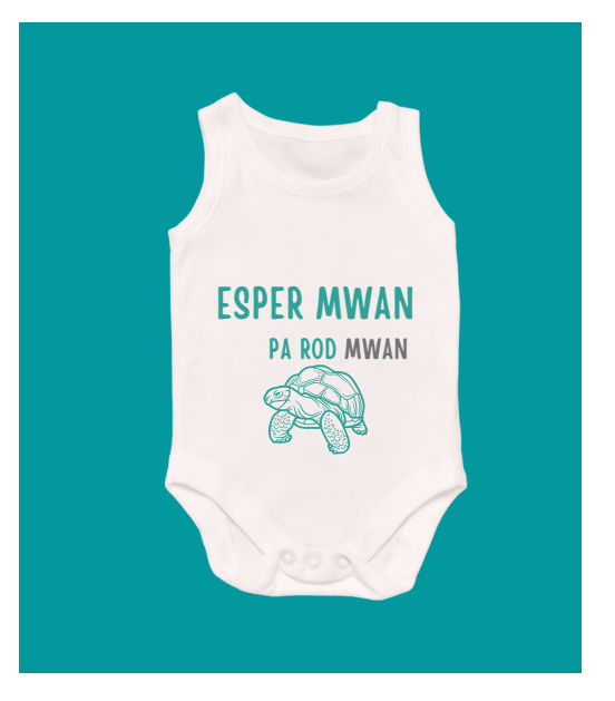
19 'Esper mwan, Pa rod mwan" |Unisex | 6-9 Months | SCR 275