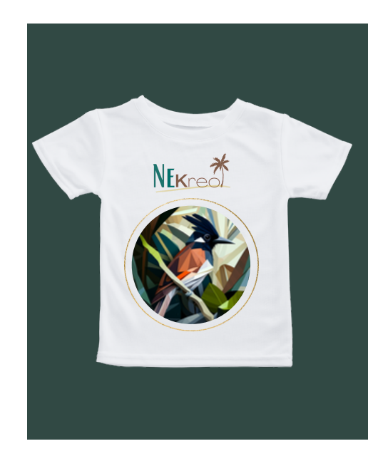
35 'Paradise Flycatcher' T-Shirt 1 Year |Unisex| SCR300