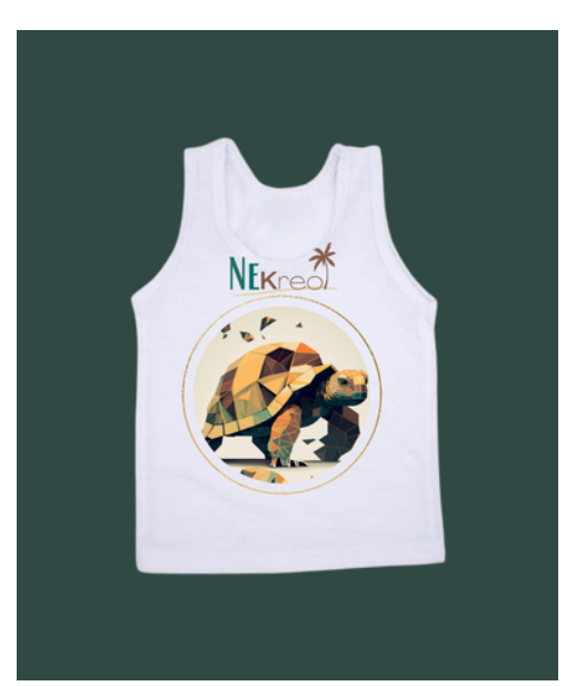
25 Giant Tortoise Vest 12-18 Months | Unisex | SCR275