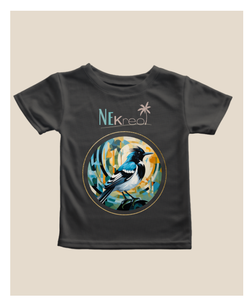
31 'Magpie Robin' / T-Shirt 12-18 Months | Unisex | SCR285