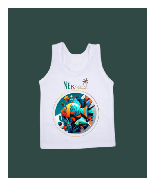
24 Tropical Fish Vest 9-12 Months | Unisex | SCR 275