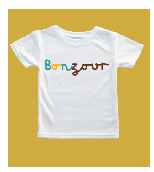
29 Bonzour T Shirt 12-18 Months | Unisex | SCR275