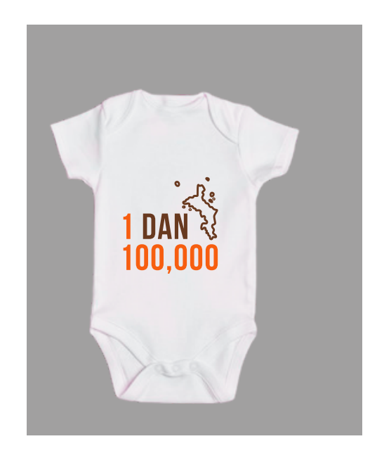
05 '1 dan 100,000' Short sleeve Onesie 3-6 Months | Unisex| SCR275