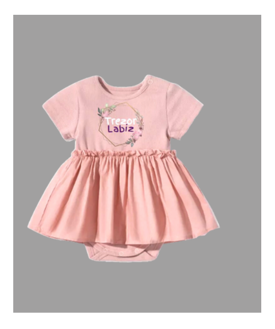
06 'Trezor Labiz' Dress (Pink) 3-6 Months | Girl | SCR275