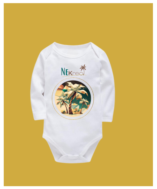
20 \ {}^{\text{`Triple Coconut Tree' Onesie}}_{\text{3-6 Months}} \ | \ \text{SCR 275}