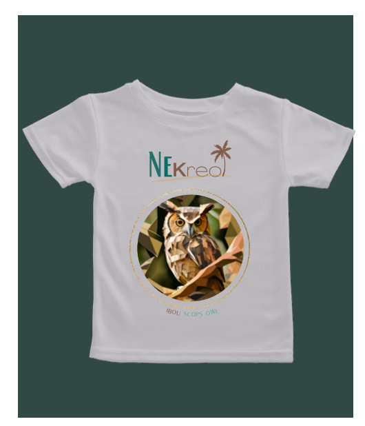
'Scops Owl' T-Shirt 4 Years |Unisex| SCR 300