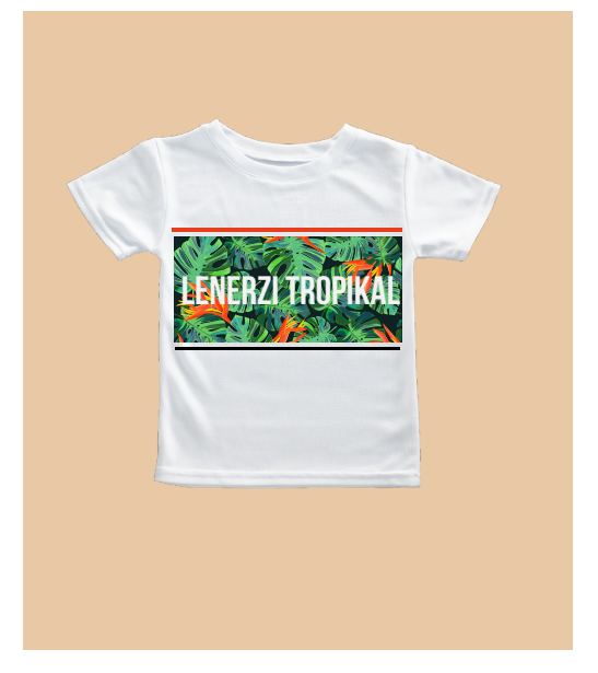
16 'Lenerzi Tropikal' T-Shirt |Unisex | 6-9 Months |SCR 285