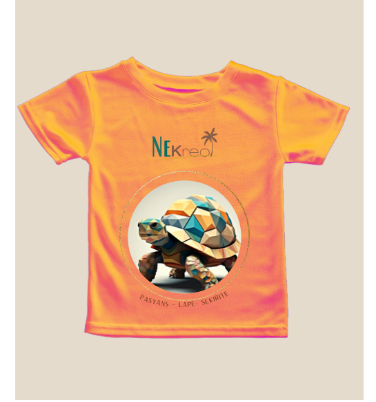
Giant Tortoise T -Shirt (Orange) 18-24 Months| Unisex| SCR 300