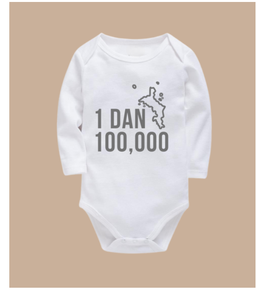
04^{\,\text{`1 dan 100,000' Onesie (Grey)}}_{\,\text{0-3 Months | Boy |SCR275}}