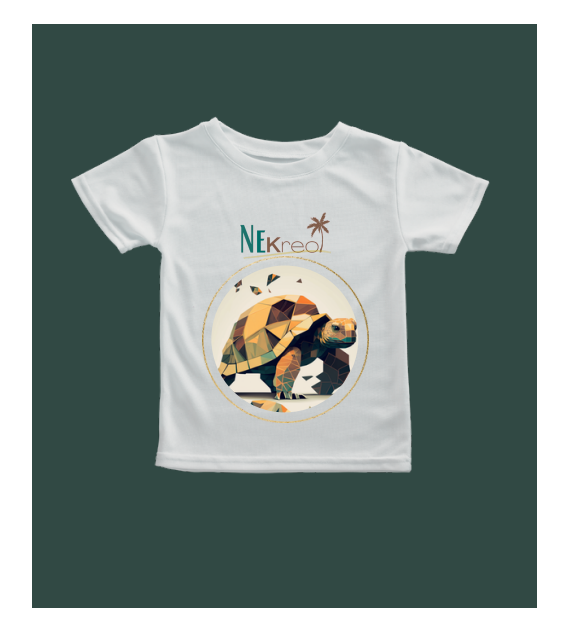
26 Giant Tortoise T Shirt (Grey) 12-18 Months | Unisex | SCR 285