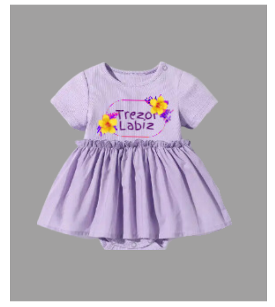
07 'Trezor Labiz' Dress (Purple) 6-9 Months | Girl | SCR285