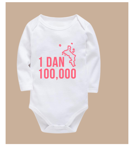
03^{\text{`1 dan 100,000' Onesie (Pink)}}_{\text{0-3 Months | Girl | SCR275}}