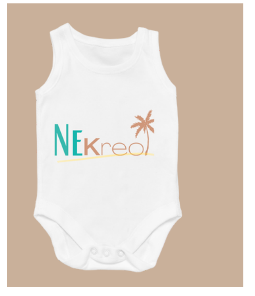
02 Nekreol Sleeveless Onesie 0-3 Months | Unisex| SCR275