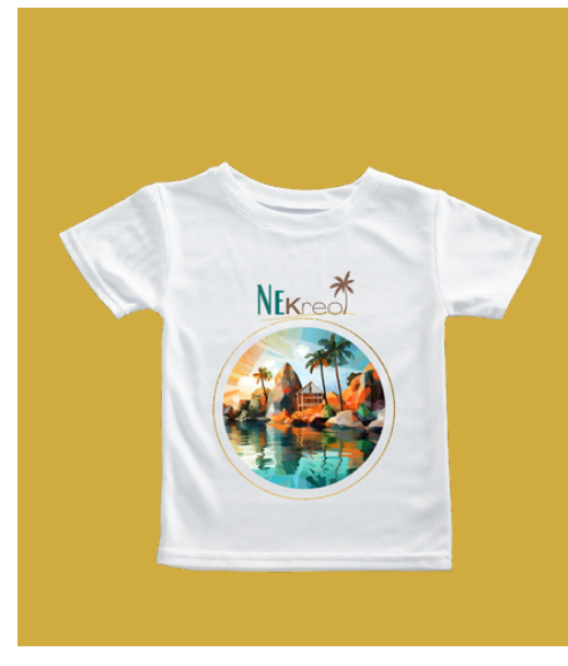
23 Island Life - T- Shirt 12-18 Months | SCR 275