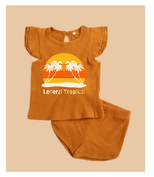
14 'Lenerzi Tropikal' T-Shirt and Short set |Girl | 2 Years |SCR 360