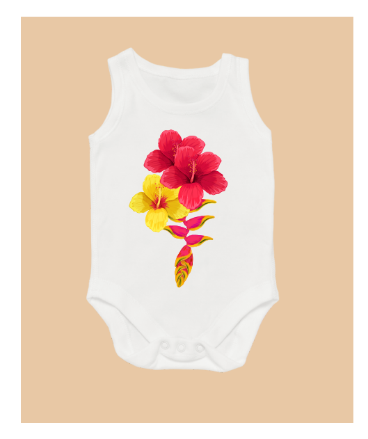
Hibiscus and hanging lobster claw flower sleeveless Onesie 3-6 months | Girl | SCR 285